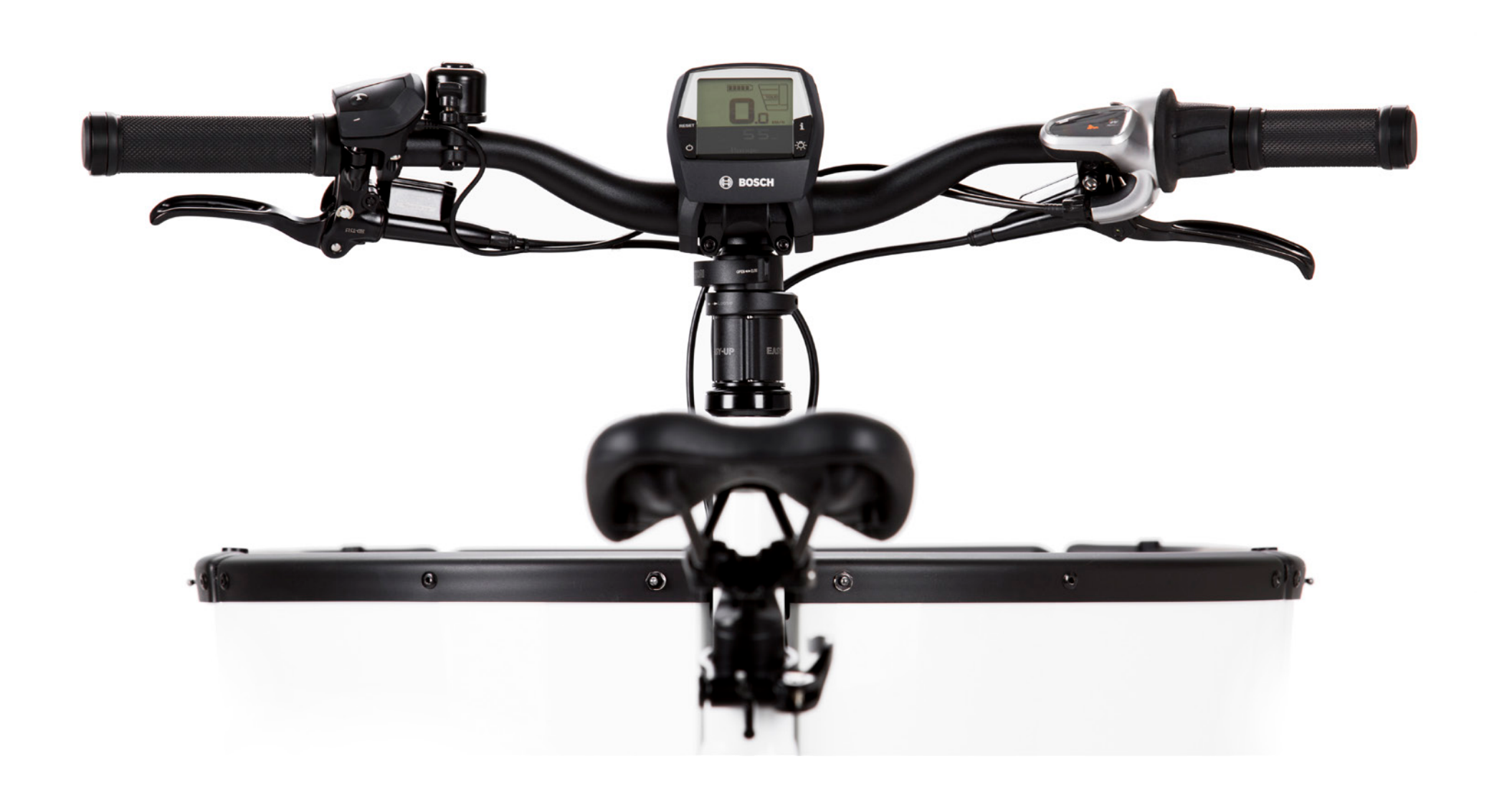
The MK1-E 'dashboard'

Integrated brake lock on front disc brakes, Bosch Intuvia operating unit (Mk1-E only), bell, detachable Bosch Intuvia Performance display (Mk1-E only) with light control switch and integrated mini-usb for phone charging and more, NuVinci 360N seamless gear shifter (or SRAM GX trigger shifter), Satori Stem reaiser with quick release adjustment.